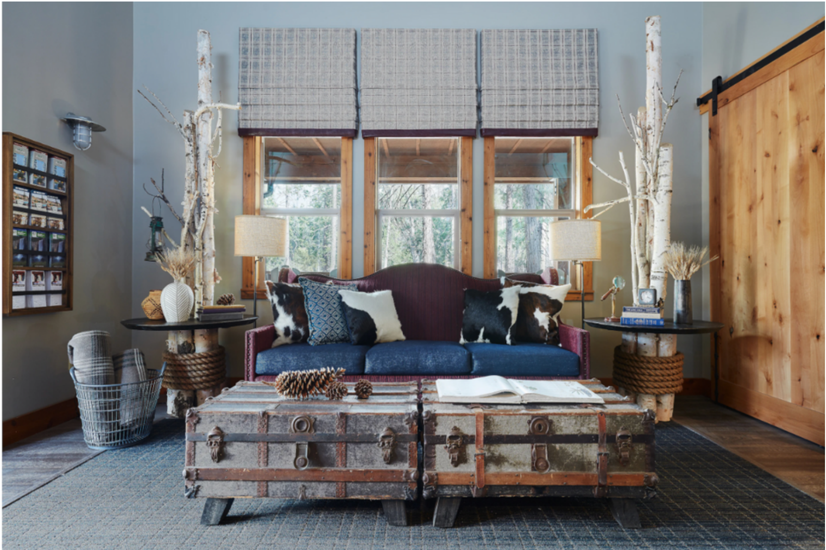
Evergreen Lodge is right outside Yosemite National Park.

These are the 10 best ranches and lodges for families in the American West.