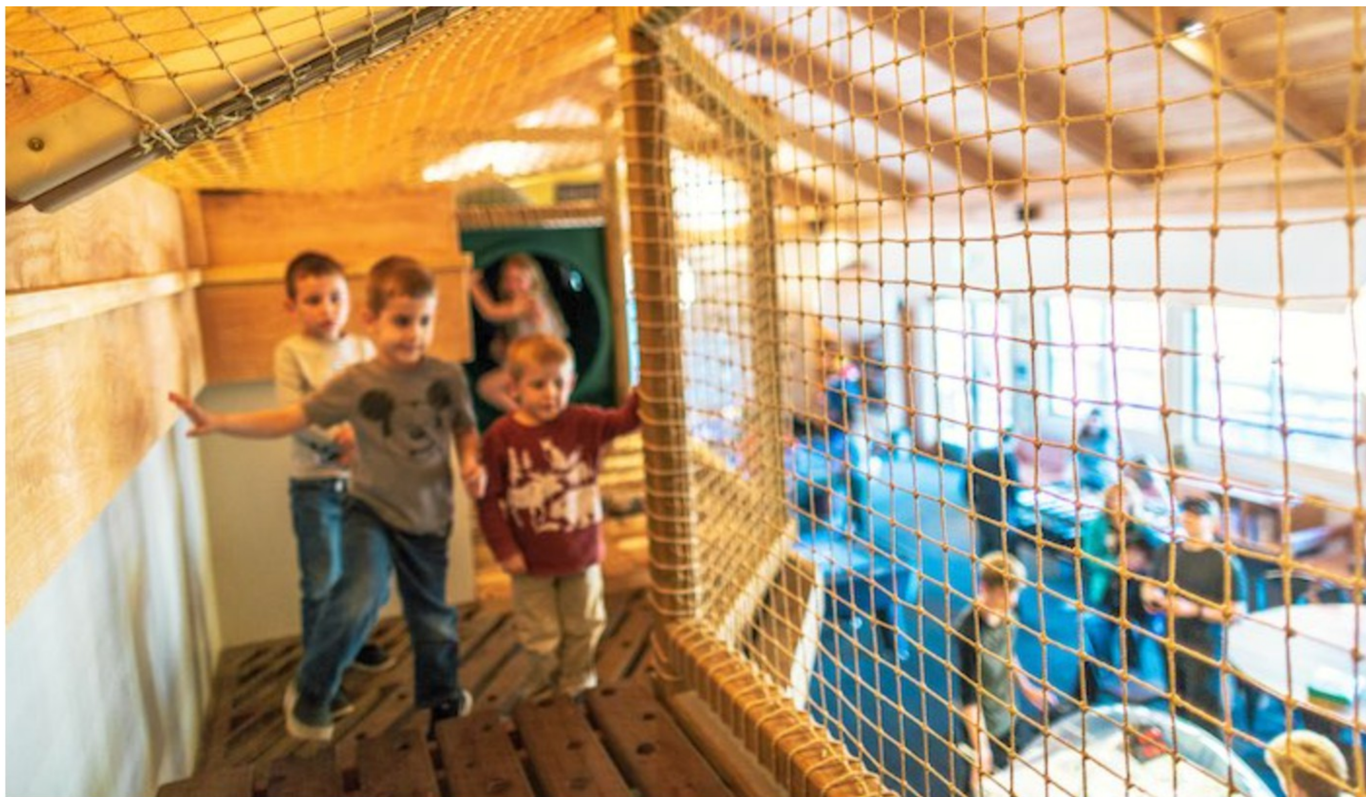
Indoor game room at Rush Creek Lodge | Photo courtesy Rush Creek Lodge

There's so much to do at the property, no one would blame you if you didn't even make it into Yosemite. But if you do want to head into the park, the hotel's proximity to the entrance makes it super easy to make the most out of your time.