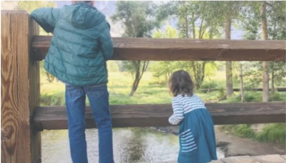
Vacation Inspiration: Yosemite with Little Kids July 30, 2021