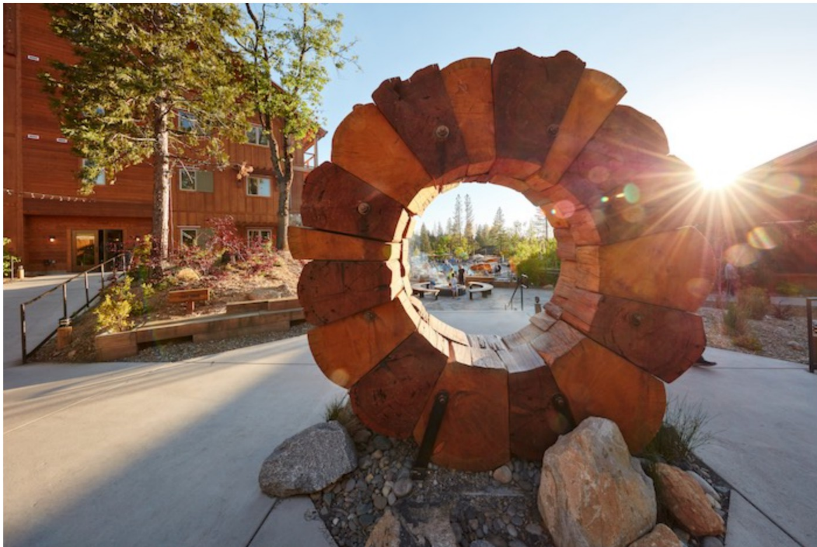
Rush Creek Lodge

As a travel writer, I go on a lot of trips with my four-year-old and one-year-old daughters. Traveling with them is wonderful and special in many ways, but of course, the trips aren't exactly relaxing. That being said, the closest I've come to being relaxed on a family trip to date was a recent visit to Rush Creek Lodge in Yosemite .