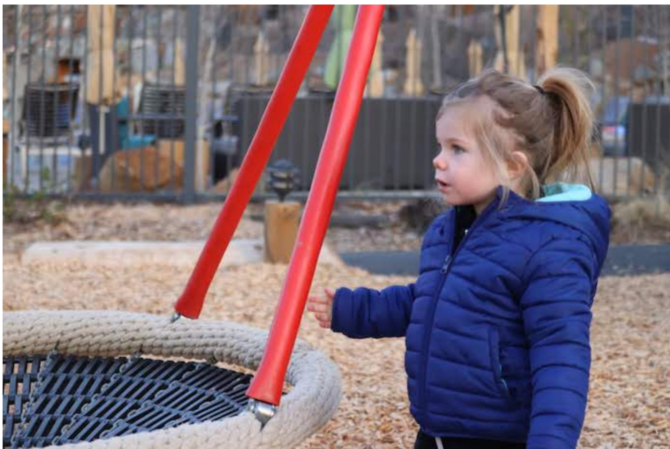
Play equipment outside the lodge

Rush Creek, located just minutes outside of Yosemite National Park, nails the perfect balance of being kid-friendly without being too kid-centric. Couples, friends, or anyone traveling without children would have a lovely time here. But parents in particular will be uber-impressed with how welcoming the hotel is to families.