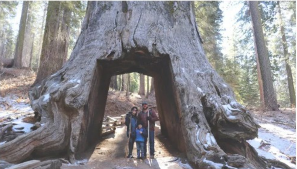
5 National Parks To Visit With Bay Area Kids Before They Grow Up March 30, 2021