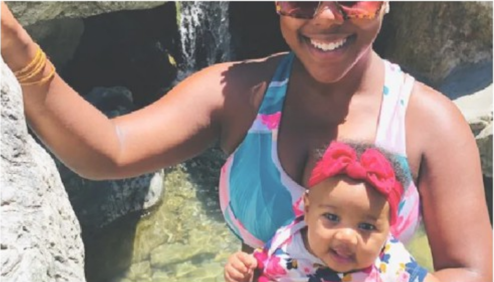
Splash And Rock Scramble at Sunol's Little Yosemite near Fremont July 22, 2020